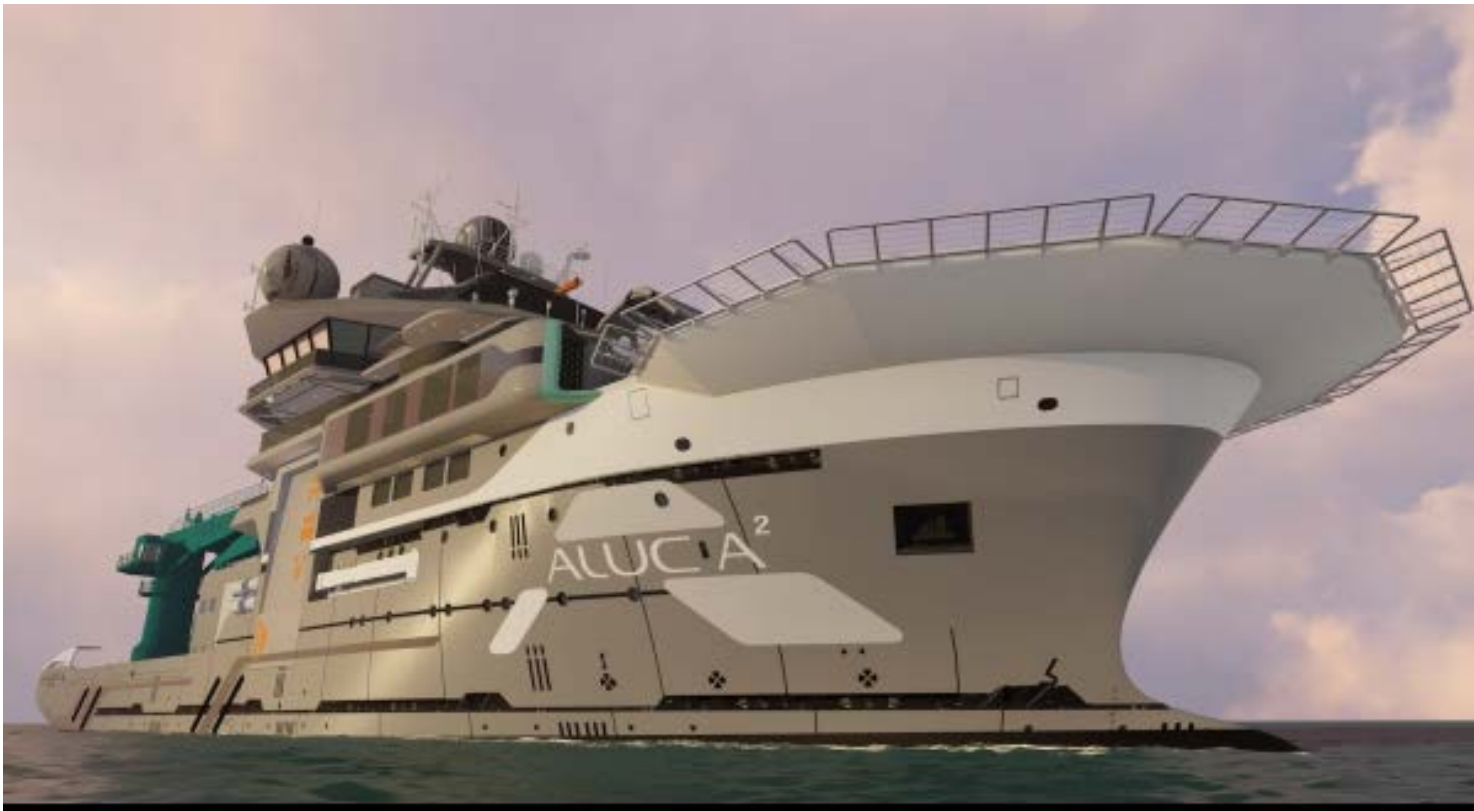
'OceanXplorer' entered the water at the Damen facilities after a mammoth conversion from oil-survey and supply vessel